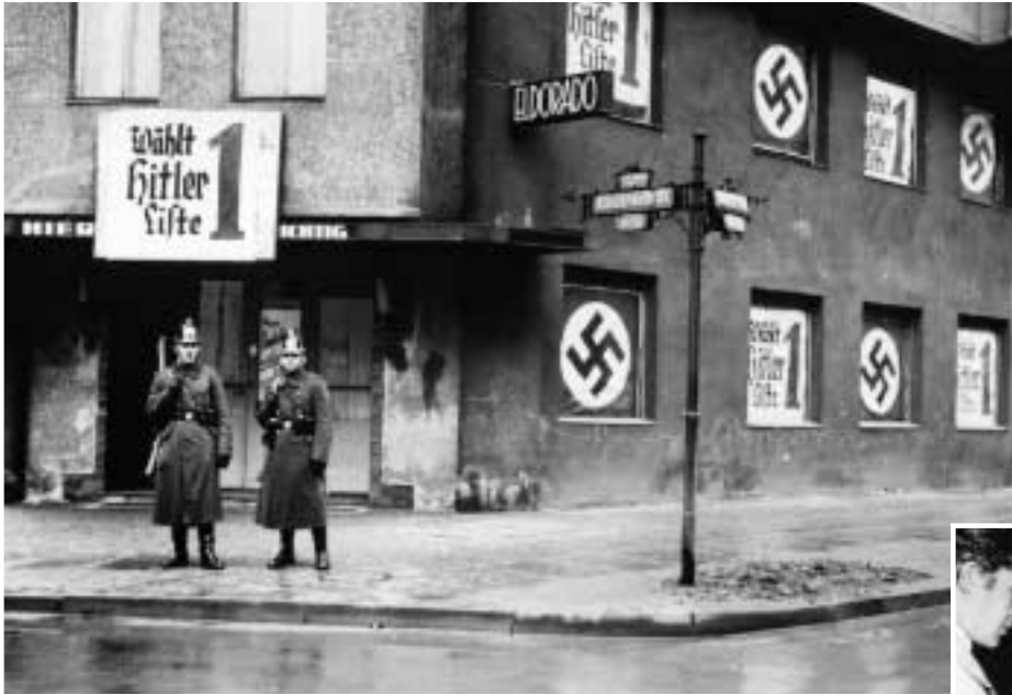
The closing of the Eldorado, a club where homosexuals socialized. Berlin, Germany, March 5, 1933.

Dr. Magnus Hirschfeld, a Jew and homosexual, founded the Institute for Sexual Sciences. Berlin, Germany, 1928.