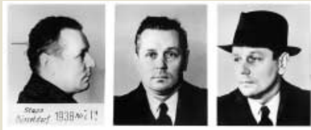
(Top) State Museum Auschwitz, Oswiecim, Poland. (Bottom) Nordrhein-Westfälisches Hauptstaatsarchiv, Düsseldorf, RW 58-61940.